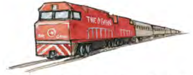
The Ghan train travels through the whole Australia.